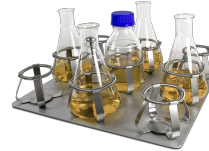
P-9/500 BS-010135-AK platform