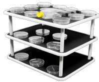
PP-20/3 BS-010126-BK platform

Flat platform with non-slip rubber mat can accommodate various low profile containers.