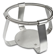
FC-2000 BS-010126-NK clamp