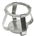
FC-250 BS-010126-JK clamp