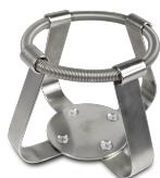
FC-500 BS-010126-LK clamp