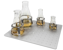
UP-168 BS-010135-JK platform

Flat platform with non-slip rubber mat can accommodate various low profile containers.