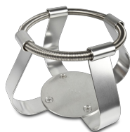
FC-1000 BS-010126-IK clamp